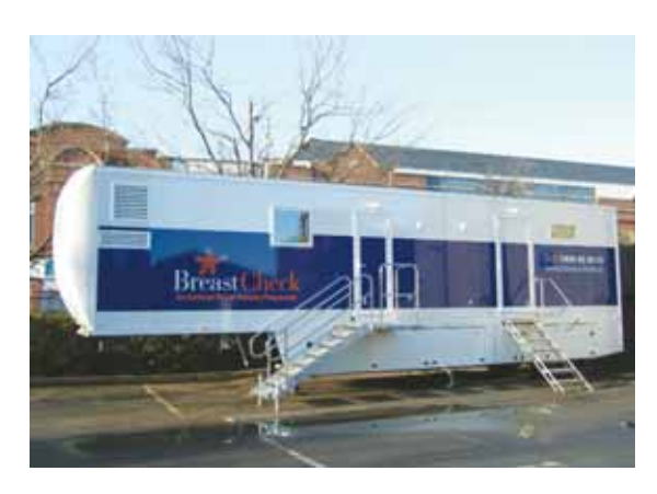
BreastCheck mobile digital screening unit

A fleet of eight mobile digital screening units have been commissioned to provide screening in broader counties. Four units will be attached to the BreastCheck Southern Unit, serving women in Cork, Kerry, Limerick, Waterford and Tipperary South and four will be attached to the BreastCheck Western Unit, providing screening to women in Clare, Donegal, Galway, Leitrim, Mayo, Roscommon, Sligo, Tipperary North.