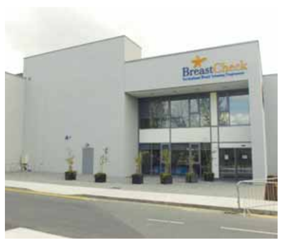
BreastCheck Western Unit