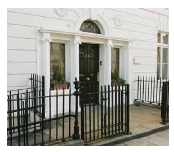
BreastCheck Eccles Unit